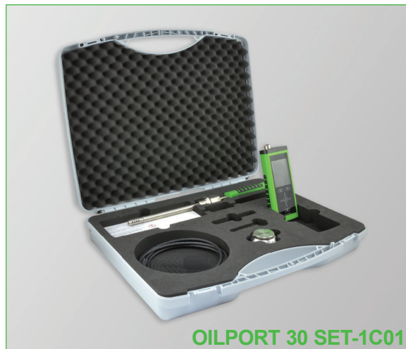
OILPORT 30 SET-1C01

The optional calibration kit is used for easy 1 and 2 point adjustment of the a_w reading.